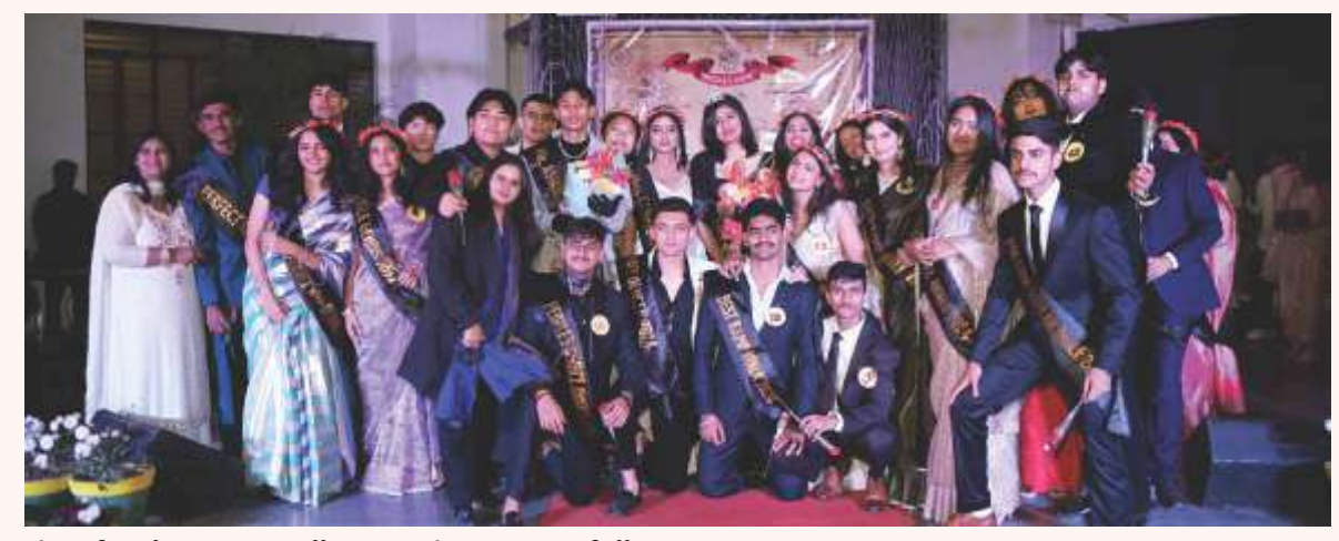
Then, the prizes for the ramp walk were given out as follows