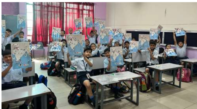
CLASS - IV (READING A MAP)