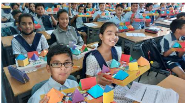
CLASS - VI ( PRISM AND PYRAMID)