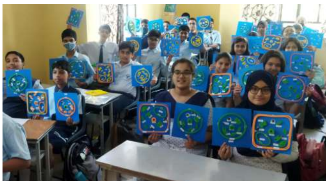
CLASS - VIII (CELL STRUTURES)