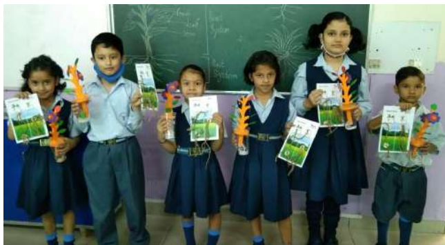
CLASS - II (PARTS OF PLANTS AND TYPES OF ROOTS)