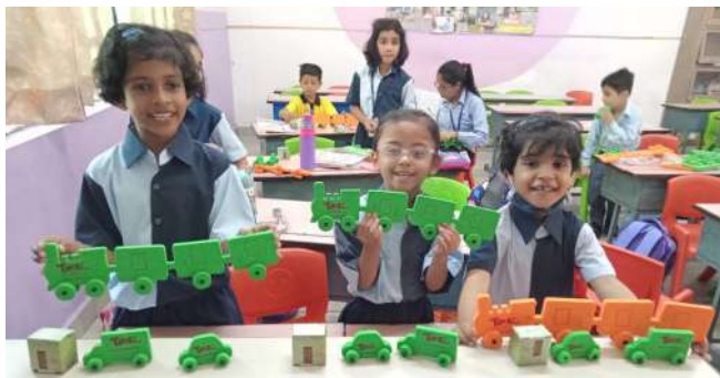
CLASS - I (FAMILY TRAIL ON THE RAIL)

In accordance with the National Education Policy (NEP), our school is trying to bring novel ways of learning for the students by introducing STEM (Science, Technology, Engineering and Mathematics) Education. In this view, the school has collaborated with TryfiBox, a product of Construkt Learning Solutions Pvt. Ltd in order to provide hands-on learning experience to students. TryfiBox has expertise in STEM based experiential learning, Coding, Robotics and all which provide a context for inquiry and discovery and help students become active problem solvers. The curriculum and courses are aligned with the best-in-class international standards to ensure global compatibility of desirable learning outcomes. Students work on real-life application to innovate.