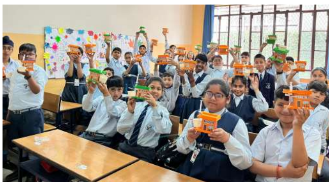
CLASS - V (RAIN WATER HARVESTING)