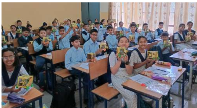
CLASS - VII (ELECTROMAGNET)