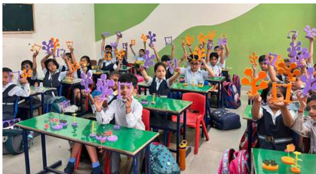
CLASS - III (TYPES OF PLANTS)