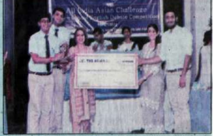
The Asian School students and faculty members holding the trophy and certificate after winning the Asian Challenge English Debate Competition 2022.