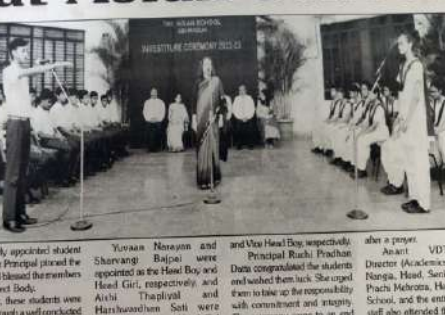
The new Prefect Body members of The Asian School taking an oath during the investiture ceremony.