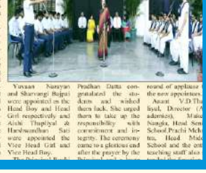
The new Prefect Body members of The Asian School taking an oath during the inauguration ceremony.