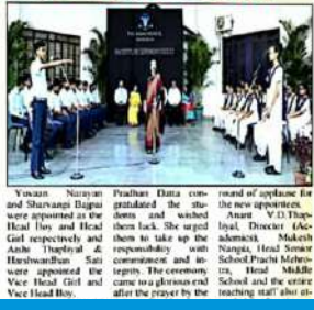
The new Prefect Body members of The Asian School taking an oath during the inauguration ceremony.