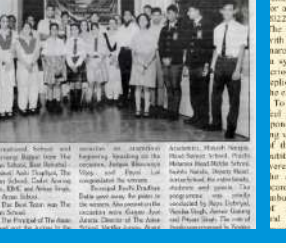
The Asian School students and faculty members holding the trophy and certificate after winning the Asian Challenge English Debate Competition 2022.

Dehradun, 1 May: The Asian School, Dehradun, emerged as the 20th Asian Challenge English Debate Trophy-2022 or titled on April 30 in the White House Court, Dehradun. The school stood entitled to the Rolling Trophy and a cash prize of Rs. 10,000. "The Asian School" emerged the 1st Runners-up. As per the tradition, The Asian School never competes for the trophy, therefore the rolling trophy and the cash prize were awarded to the Asian School.