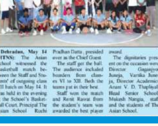
Asian School students and staff members celebrating their victory in a basketball match.