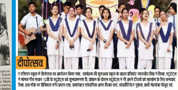
Students performing a traditional lamp-lighting ceremony (Diya Pooja) on stage.