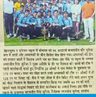
Asian School students celebrating their victory in a cricket match against the school staff.