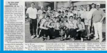
Asian School students celebrating their victory in a cricket match against the school staff.